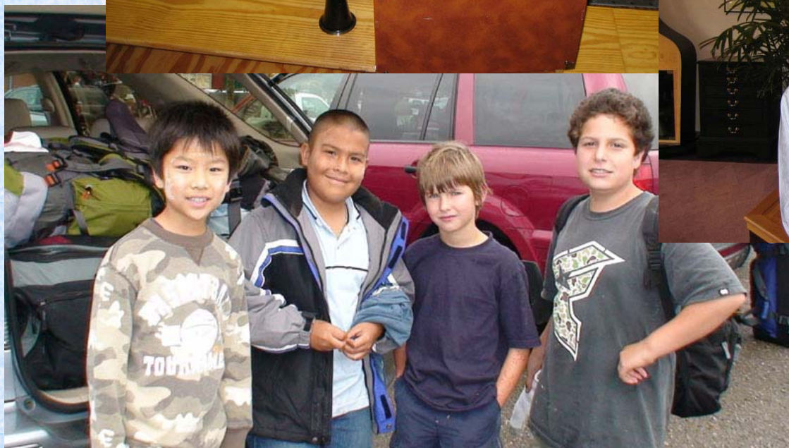
Walker Creek camping, Oct. 07