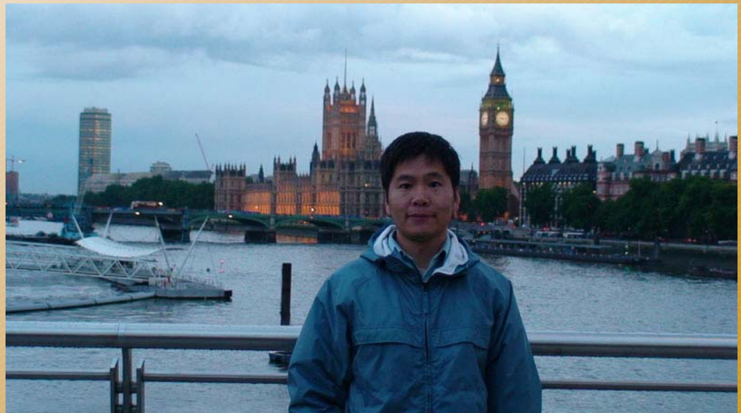
London, June 07