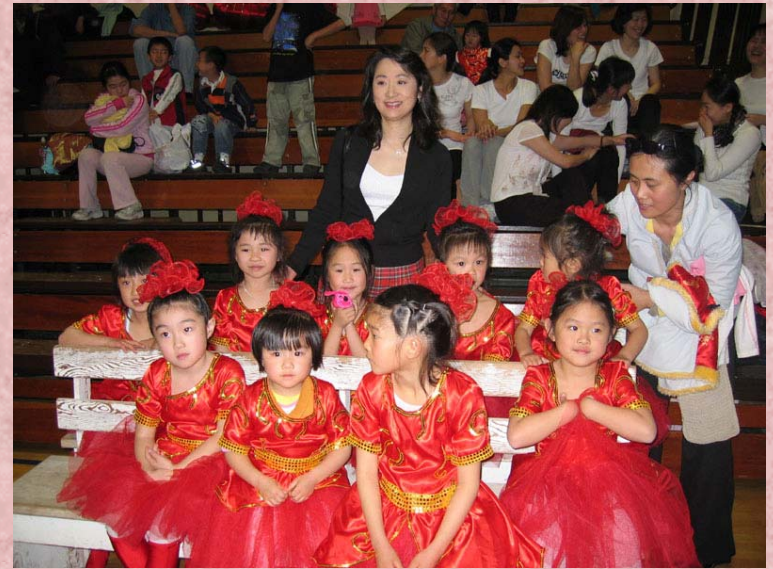
Dancing class, Feb. 07