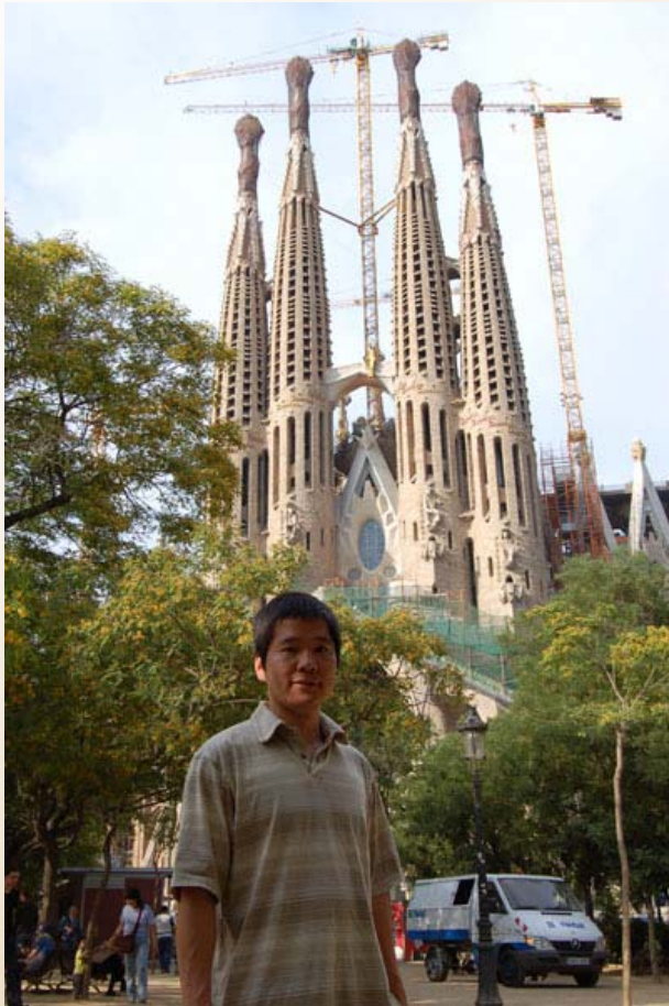
Temple de la Sagrad Familia