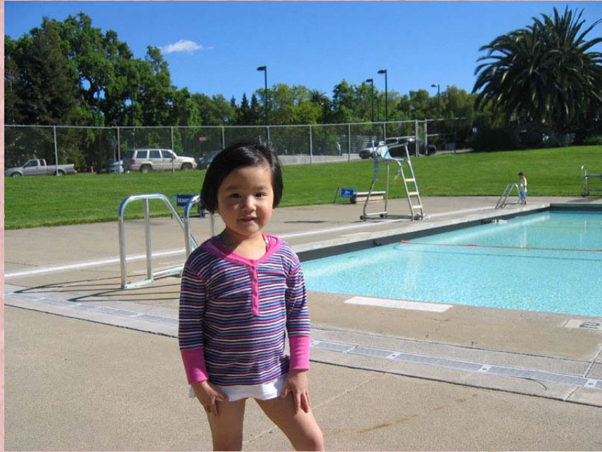
From starfish to seahorse to lobster, summer, 07