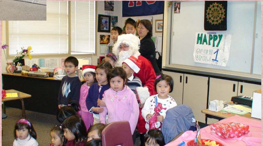
Chinese class, Dec. 07