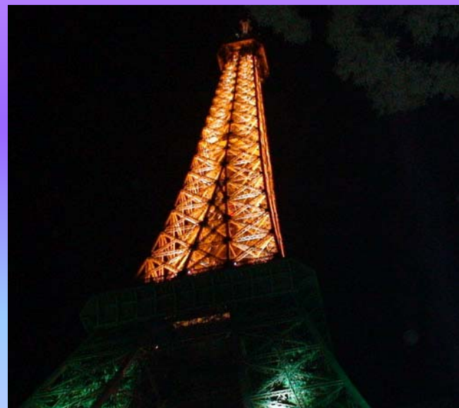
Paris, Oct. 07, for 2007 microTAS Conference