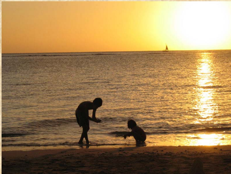
Hawaii, Dec. 06