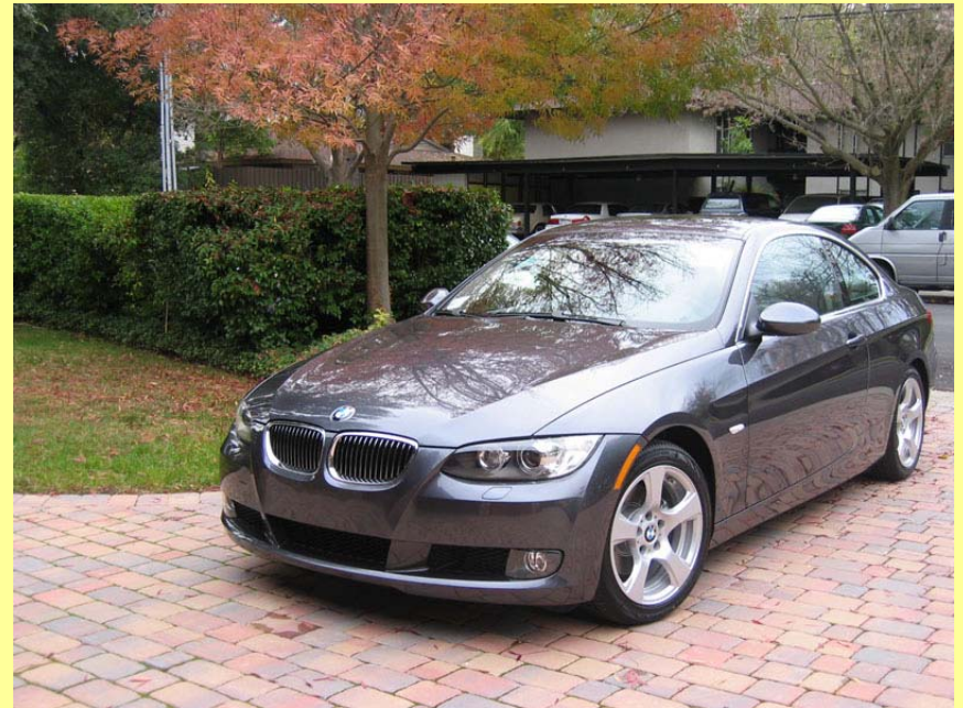
2008 BMW 328i coupe, sparkling graphite

We bought a house in Guangzhou with Junyu's parents.